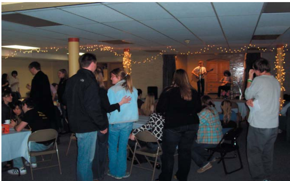
Students at the UBC Coffeehouse on March 13th, 2009