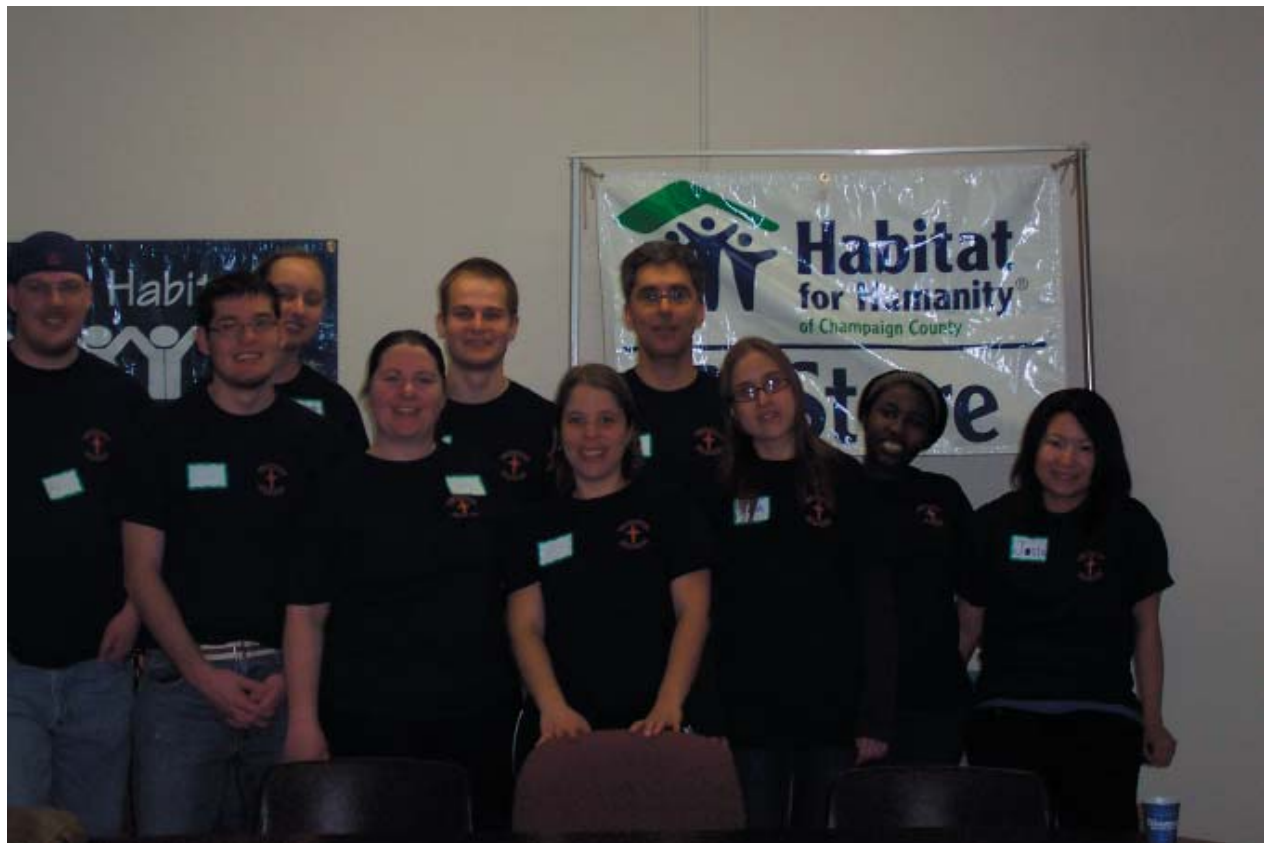
Some Sutton Residents volunteering for Habitat for Humanity with UBC

This upcoming fall semester will bring many changes for Sutton Place. It will now be an all male house for fifteen residents. The reduction in house residents arises due to a city code that would require an installation of an expensive sprinkler system if the house has over sixteen residents. The change from co-ed to men only makes sense because, with the addition of 312 House to the Baptist Housing Ministry, we can now have the preferred option of single sex residences for graduate men and women.